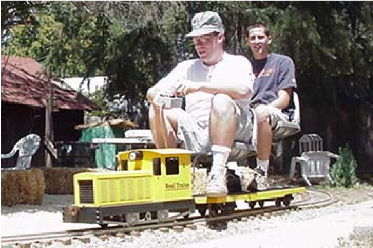
Some Items Shown are Optional at Extra Cost