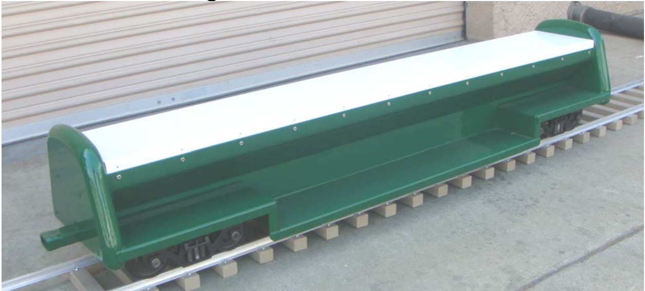
Trucks Shown For Illustration Only, Not Included