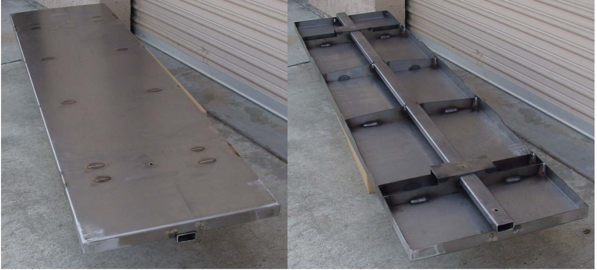
Bottom View Showing Structure

Car may be used as furnished as a work car - add seats for a riding car - or use as the basis for construction of any style car (all the metal work is done if you are a woodworker).